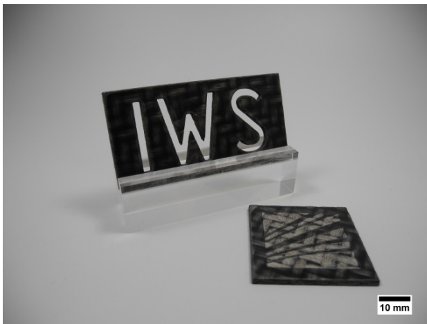
Laser-remote cut fiberglass reinforced plastic and defined surface matrix ablation